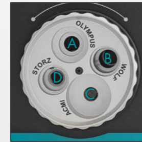
Turret, multi connector

An easy-to-use turret connector helps to connect the most common cables.